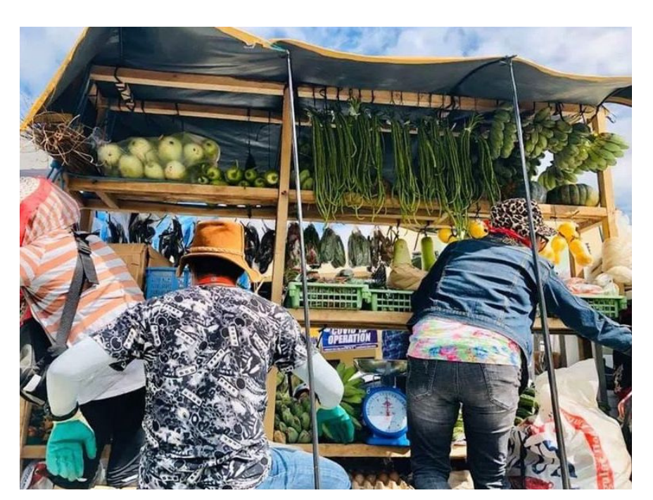
Farmers setting-up their produce on the Vegetable on Wheels

LGUs, even before the national government has ordered a lockdown on March 12, 2020, have immediately formed their respective task forces, gathered their stakeholders and put up the necessary protocols and systems to manage the impact of COVID-19. As early as January 2020, the Cities of San Jose del Monte, Lipa, Iriga, Sipalay, and Mati have mobilized their local government to do the aforementioned actions. On January 29, 2020, the City of SJDM organized an information drive about then 2019nCOV for its 130 City Health personnel and 650 barangay health workers.