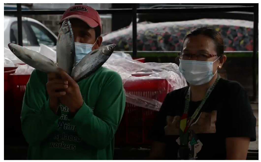
One of the fisherfolk beneficiaries of the local government of Sipalay City

Preserving the environment is the main strategy of the local government of Sipalay City, as a recognition that their local economy hugely depends on it. The LGU recognizes that the ecosystem-based approach would be an effective way to sustain its natural resources, which serve as the lifeblood of the municipality. As Sipalay City does its tourism development initiatives, COVID-19 forced LGUs to close borders to contain the virus. Inevitably, this hugely affected the livelihoods of Sipalaynons who are heavily reliant on the tourism industry. As a response to the livelihood dilemma, the LGU of Sipalay launched its "Ginapangabuhi-an" project which aims to assist the displaced Sipalaynon workers. In partnership with the Department of Social Welfare and Development (DSWD) and the Department of Trade and Industry (DTI), the beneficiaries of Ginapangabuhi-an development (GAD) budget as well to fund more small entrepreneurs. The livelihood assistance by the LGU also serves as a preparation once travel restrictions would allow them to receive tourists, keeping in mind the need to conserve their local resources.