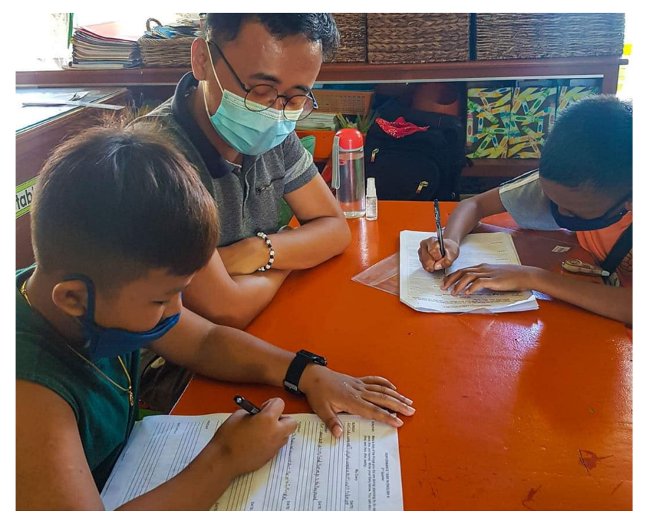
Young learners guided by a volunteer teacher in Tabaco City's Community Learning Hub

COVID-19 has caused enough disruption that Tabaco City did not allow it any further to affect the continuous provision of quality education to its children. The City collaborated with the Office of the Vice President of the Philippines and Siklab Pilipinas to establish community learning hubs which provided gadgets, internet access, and tutoring services to elementary school learners. Learners with difficulties accessing online and modular learning systems, as well as parents not prepared to assist their children, found relief in the community learning hubs with volunteer licensed teachers managing their sessions.