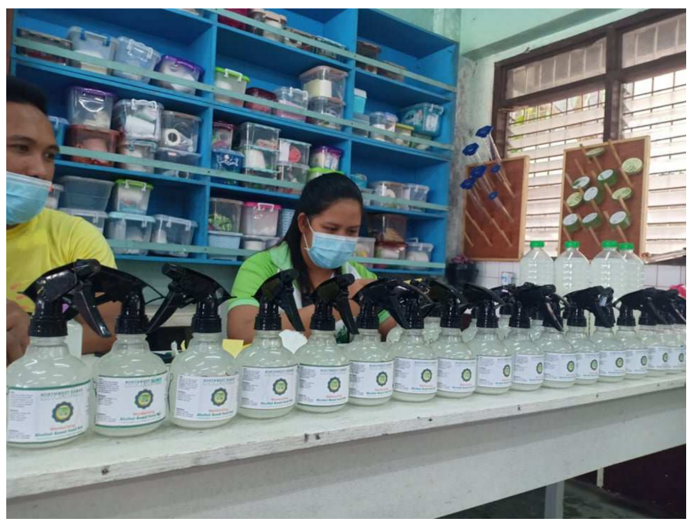
Northwest Samar State University making moisturizing alcohol-based handrub for frontliners in Calbayog City

At the onset of the pandemic, Calbayog City was quick to tap its stakeholders to help in containing the COVID-19 virus. The LGU partnered with the Northwest Samar State University and public elementary schools to serve as facilities to accommodate locally stranded individuals (LSIs) and returning overseas Filipino workers (OFWs). Barangays also led local assemblies to educate residents about COVID-19 and the protocols needed to be adhered to. The immediate action of the local government and cooperation among residents serve as important strategies in containing the pandemic in Calbayog City.