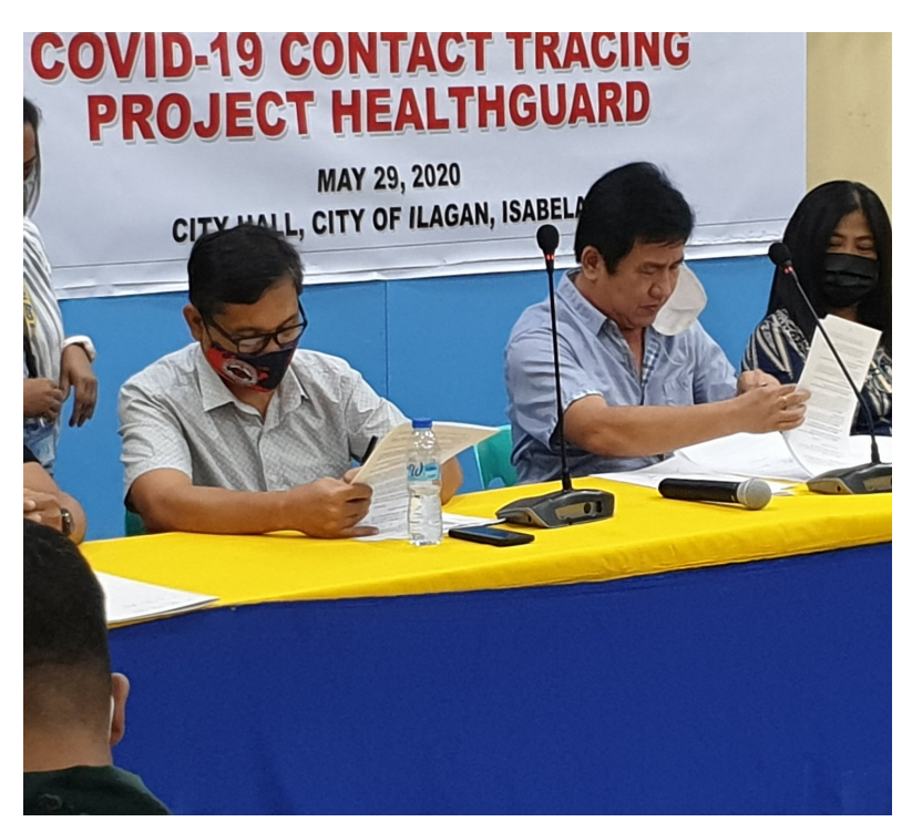
The Local Government of Ilagan signing the Memorandum of Agreement with Isabela State University for the implementation of the Health Guard Contact Tracing System

A smart city, as described by the Organization for Economic Co-operation and Development (OECD) or OECD, leverages on digitalization to boost citizen well-being and deliver more efficient, sustainable and inclusive urban services and environments as part of a collaborative multi-stakeholder process. Digitalization is seen as an effective way to manage data and information that would help leaders in making better and informed decisions. LGUs are keeping up in this inevitability of a digital world. Prepandemic, LGUs like the cities of Lipa in Batangas and Himamaylan in Negros Occidental have set out plans to digitalize their processes. As we battle out COVID-19, digitalization is seen as a necessary initiative.