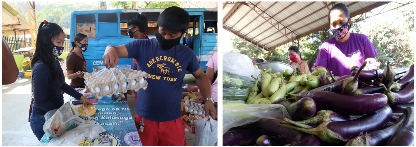
Residents of Candon City, Ilocos Sur purchasing their various food produce from the local government's Market on Wheels

LGUs have the shared responsibility to keep their people safe from the threats of natural and man-made disasters caused by environmental degradation, urbanization, marginalization, and high population density to name a few. A safe community means people are able to live their lives free from any fear, worry or threat from violence, exploitation or conflict that would affect their development. During this pandemic, this has been the priority of all local government units. All LGUs have been focused on identifying initiatives to contain the COVID-19 virus, and to ensure that they meet the public's basic needs. For the participating local governments in the PAILPD Program, they prove that in addressing community safety, the public has to be involved.