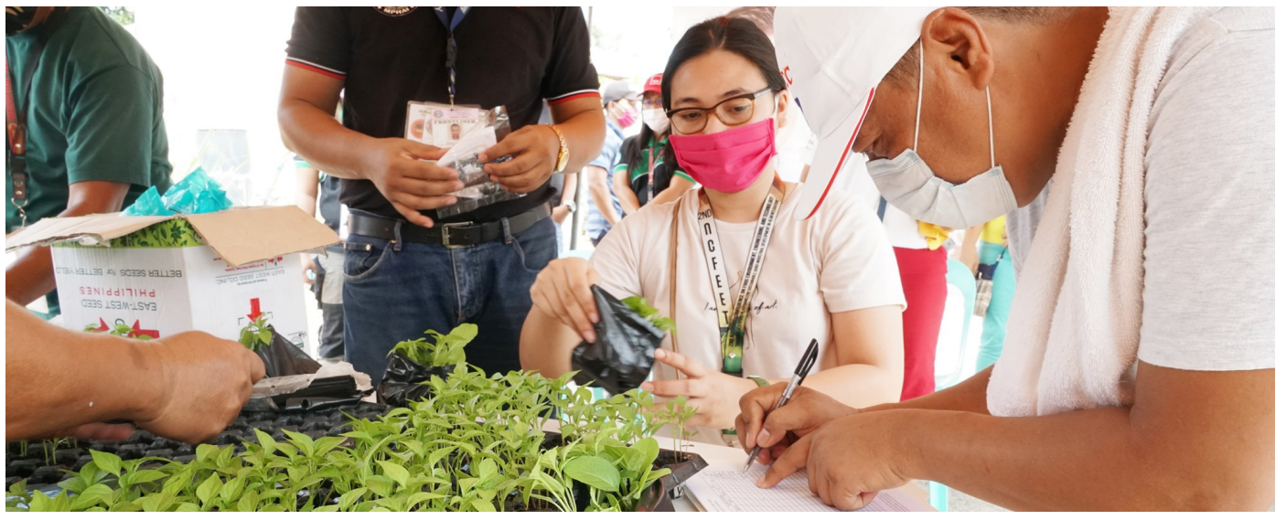
A resident in Barangay Muzon taking part in the City of SJDM's "Gulayan sa Pamayanan" Project

The Cities of San Jose del Monte, Bulacan and Tabaco, Albay proved to us that having sufficient and accurate data helps in making informed decisions for program planning and implementation. In the case of SJDM, although the data did not paint a good picture of their COVID-19 situation, it served as a wake-up call to look into the issue and identify gaps, which led them in implementing SPSS. For Tabaco City, their CBMS enabled them to extend the necessary financial assistance for its residents who were not part of the Social Amelioration Program. For the other LGUs that have implemented digitalization such as Ilagan City, Lipa City, Roxas City and Himamaylan City, they utilized technological advancements which allowed them to better manage their data.