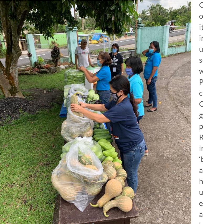
Agricultural staff preparing the vegetables harvested by the farmers in Tabaco City

Tabaco City, through its project Kadiwa on Wheels, coordinated with the Department of Agriculture to buy the produce of its farmers, which were then sold in satellite markets managed by the Solo Parents' Association. Kadiwa on Wheels did not only ease the livelihood situation of the farmers and solo parents, but it also offered convenience and safety for residents in purchasing their basic goods.