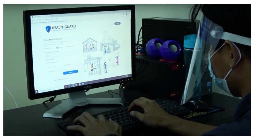
The Local Government of Ilagan signing the Memorandum of Agreement with Isabela State University for the implementation of the Health Guard Contact Tracing System

To complement the COVID-19 testing laboratories established in the City, the LGU of Roxas City in Capiz further utilized technology in its implementation of DIRECTS or the Digitized Roxas City Epidemiological Contact Tracing System, a mobile app to effectively conduct contact tracing; and E-Consulta, a contactless consultation and prescription system. Putting E-Consulta in place provides people with an alternative way to seek medical advice without the need to go to the hospitals.