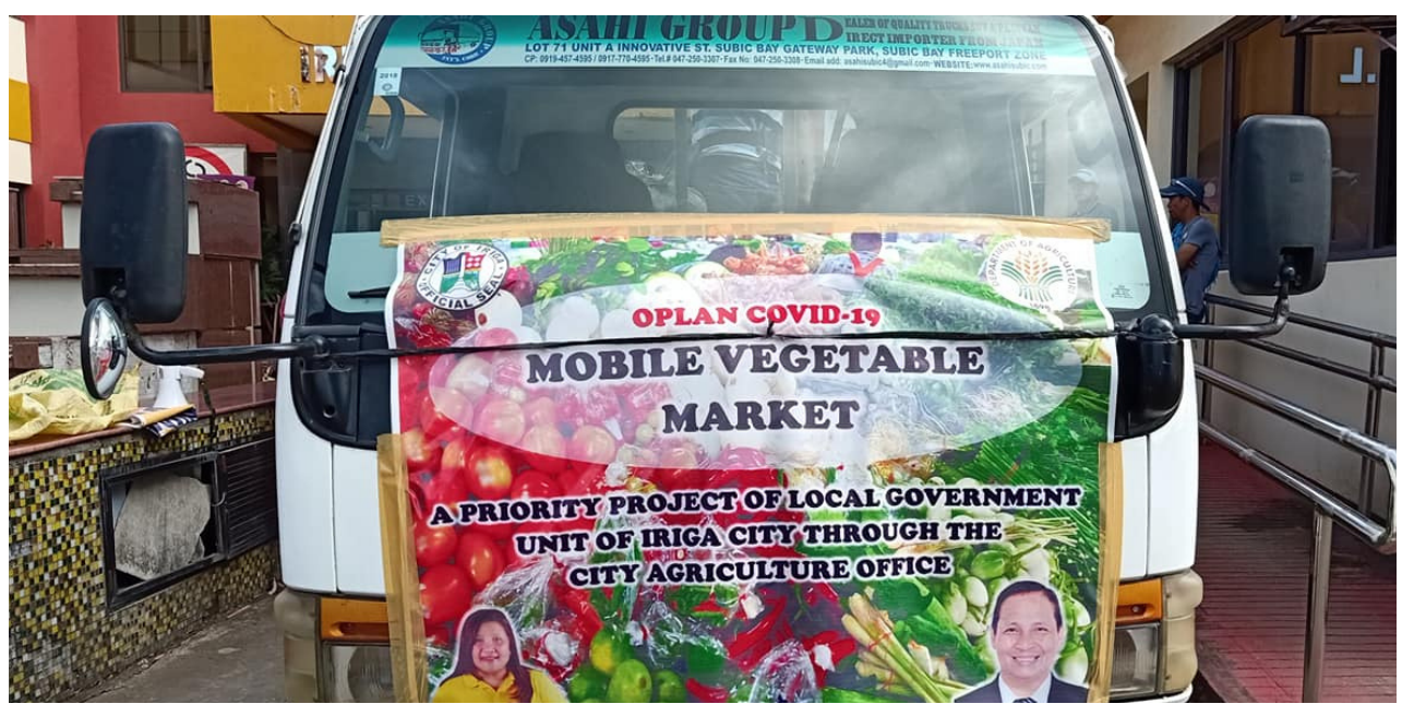
Vegetables on Wheels in Iriga City

LGUs have proven their resilience in the midst of COVID-19. Their different versions of food sustainability initiatives, beyond providing financial assistance, show us that their leadership enables their local governments to become self-sufficient and self-reliant. In the case of the City of San Jose del Monte, Bulacan, its "Gulayan sa Pamayanan" project aims to provide its residents with a more sustainable food source so that they would not be dependent on ayudas. The same goes with the other LGUs such as Iriga City, Camarines Sur and Gingoog City, Misamis Oriental. These are good examples of food security and we are yet to see how their agricultural practices ensure environmental sustainability.